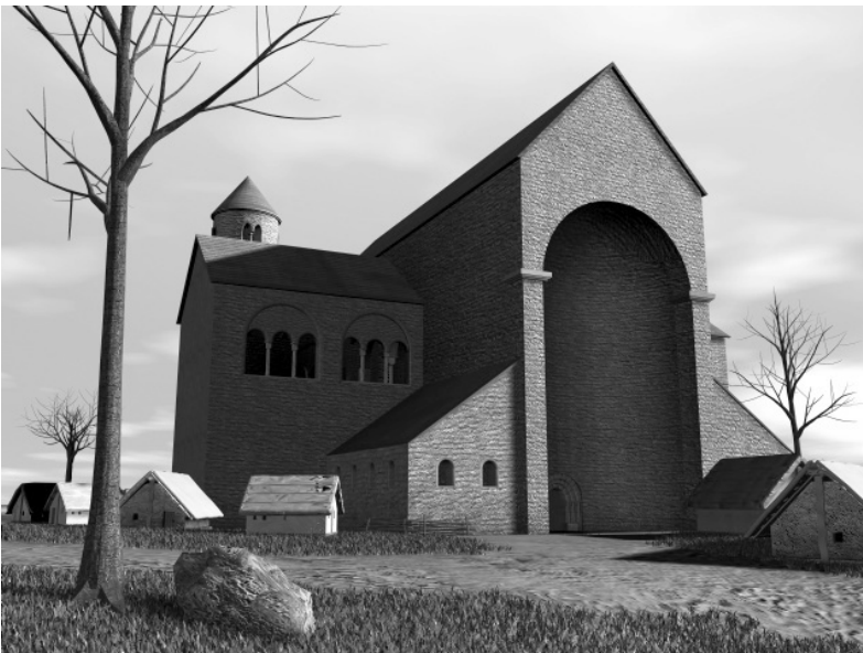
Figure 1: A photorealistic image of the virtual reconstruction of the area around the Kaiserpfalz of Magdeburg, rendered with a standard 3D rendering tool (original image in color).

The virtual reconstruction of lost buildings as a means of recreating lost cultural heritage has become a strongly growing field of application for computer graphics [1]. Research results of historians and archeologists are used by computer scientists to create computer models as a base for visualizations. Typically, off-the-shelf software is employed that allows generating images with the quality of photographs (see, for example, Figure 1).