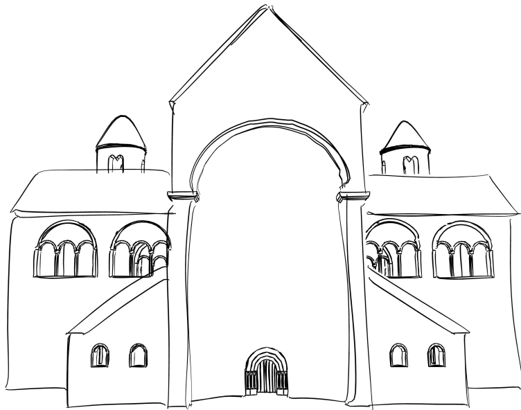
Figure 2: A sketch-like rendition of the reconstructed building. Here, the same 3D model as in the previous image is used, but the “sketchy” character of the line drawing proposes a preliminary design state. This type of image does not pretend that the expert knows exactly how the building has looked like in the 10 th century.

A new field in computer graphics, the so-called “non-photorealistic rendering,” offers promising alternatives that aim at avoiding those unintentional visual fixations [2]. Non-photorealistic visualizations (like the one shown in Figure 2) provide scientists with methods to handle uncertain knowledge in computer models. Here, attributes describing reasons or alternatives can be stored along with the usual geometric data. From this data, visualizations can be generated that are honest with respect to the degree of certainty, the reasons, and the alternatives.